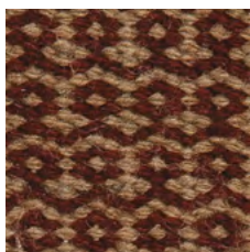
BR | B