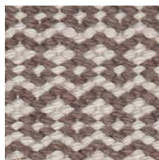
CR | LG