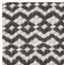
CR | TL